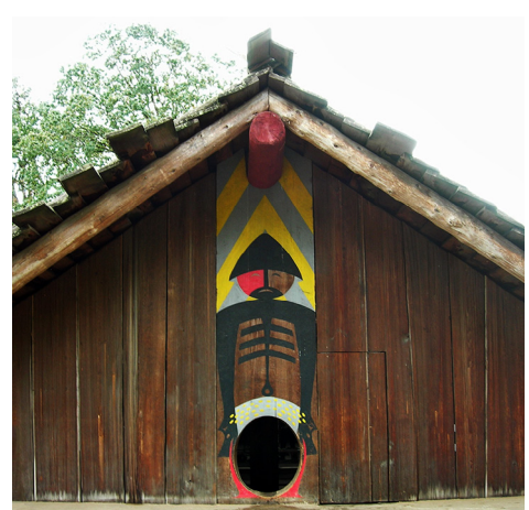
of several months, with input from endorsing organizations that span Indian Country, and shared in November at the National Congress of American Indians Annual Convention and Marketplace in New Orleans.

Recent and Ongoing Advocacy In December 2023, twelve leading Native organizations—including the Native American Contractors Association—announced that they have joined together to develop companion economic policy briefs focused on concrete steps congress and the Biden Administration can take to boost tribal economies and Native-owned businesses. The briefs were developed in the course